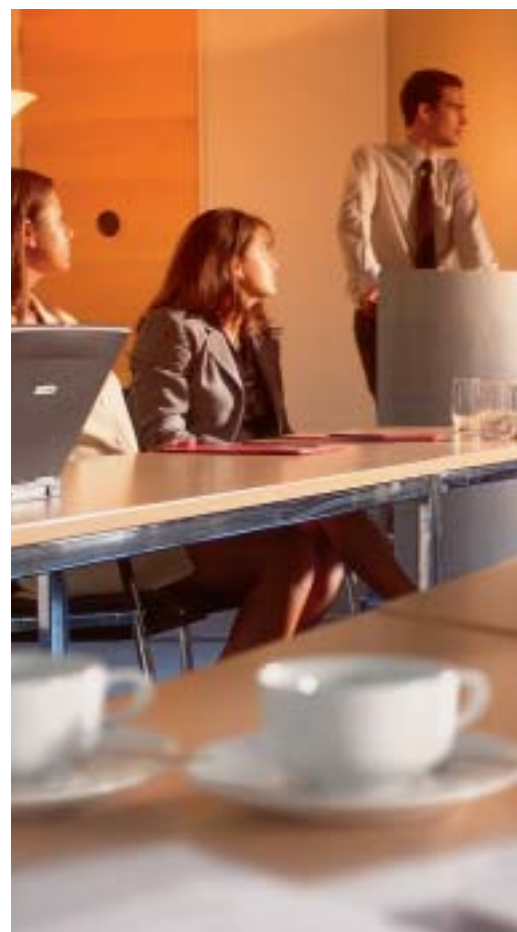
A typical Regus Meeting Room